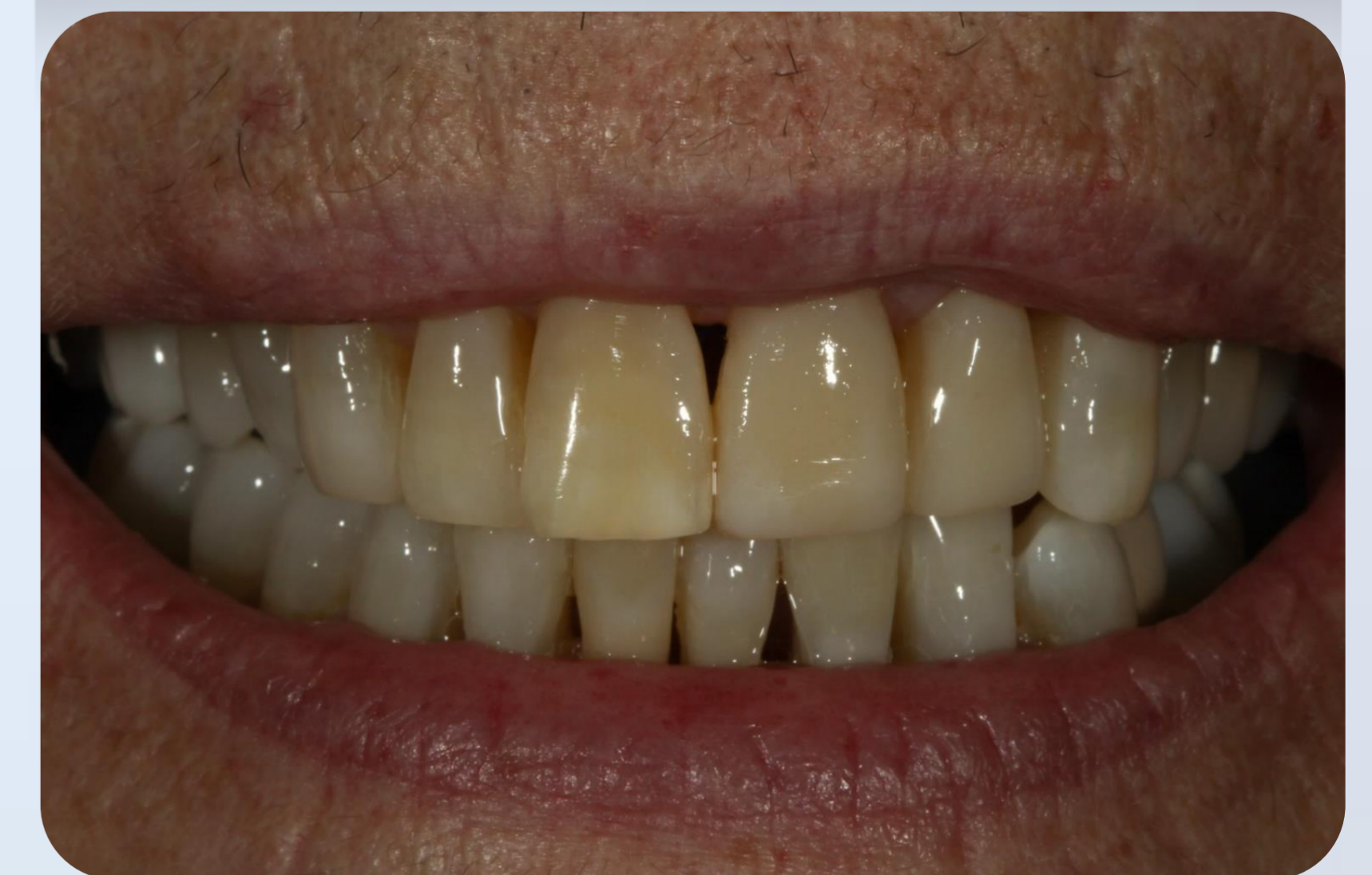
9. Patient's final smile