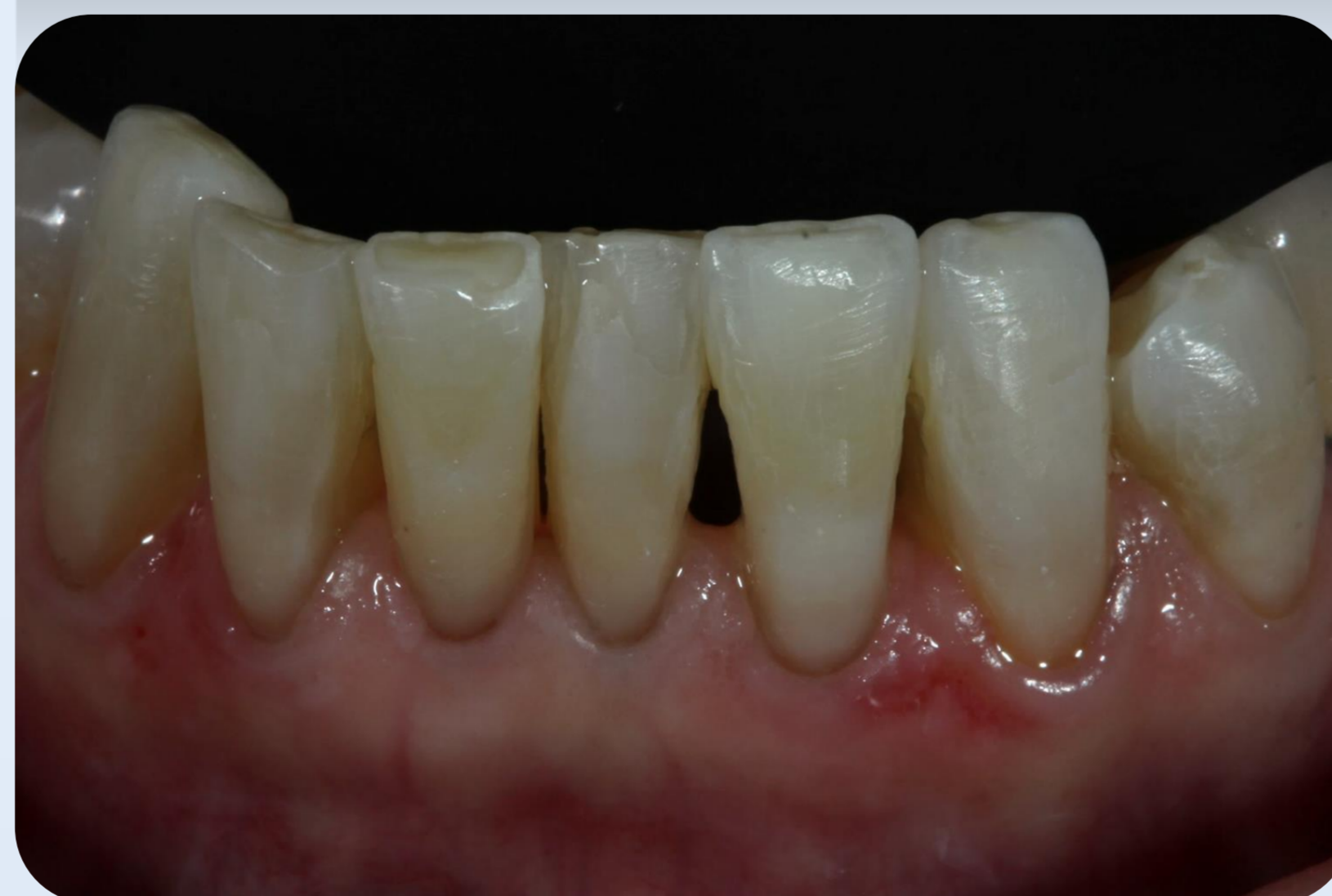
8. Freehand composite resin restorations