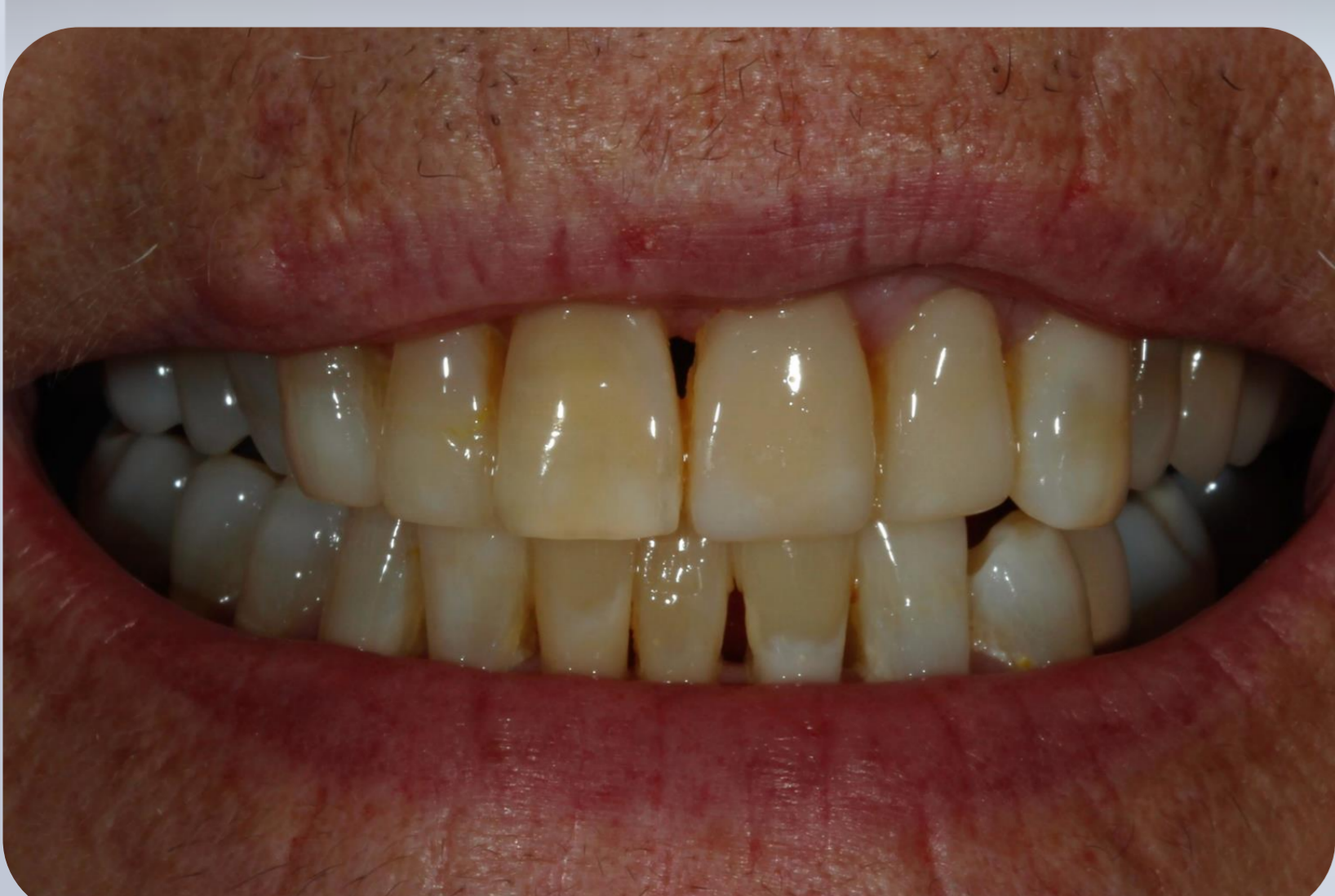
10. After 1 year