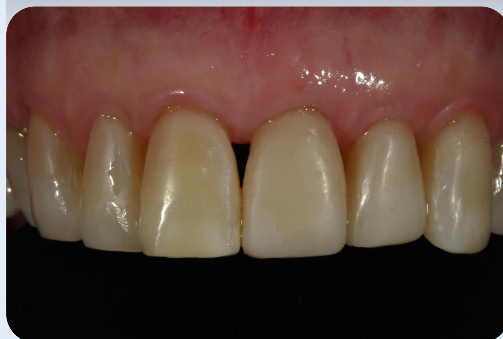
5. Freehand composite resin restorations