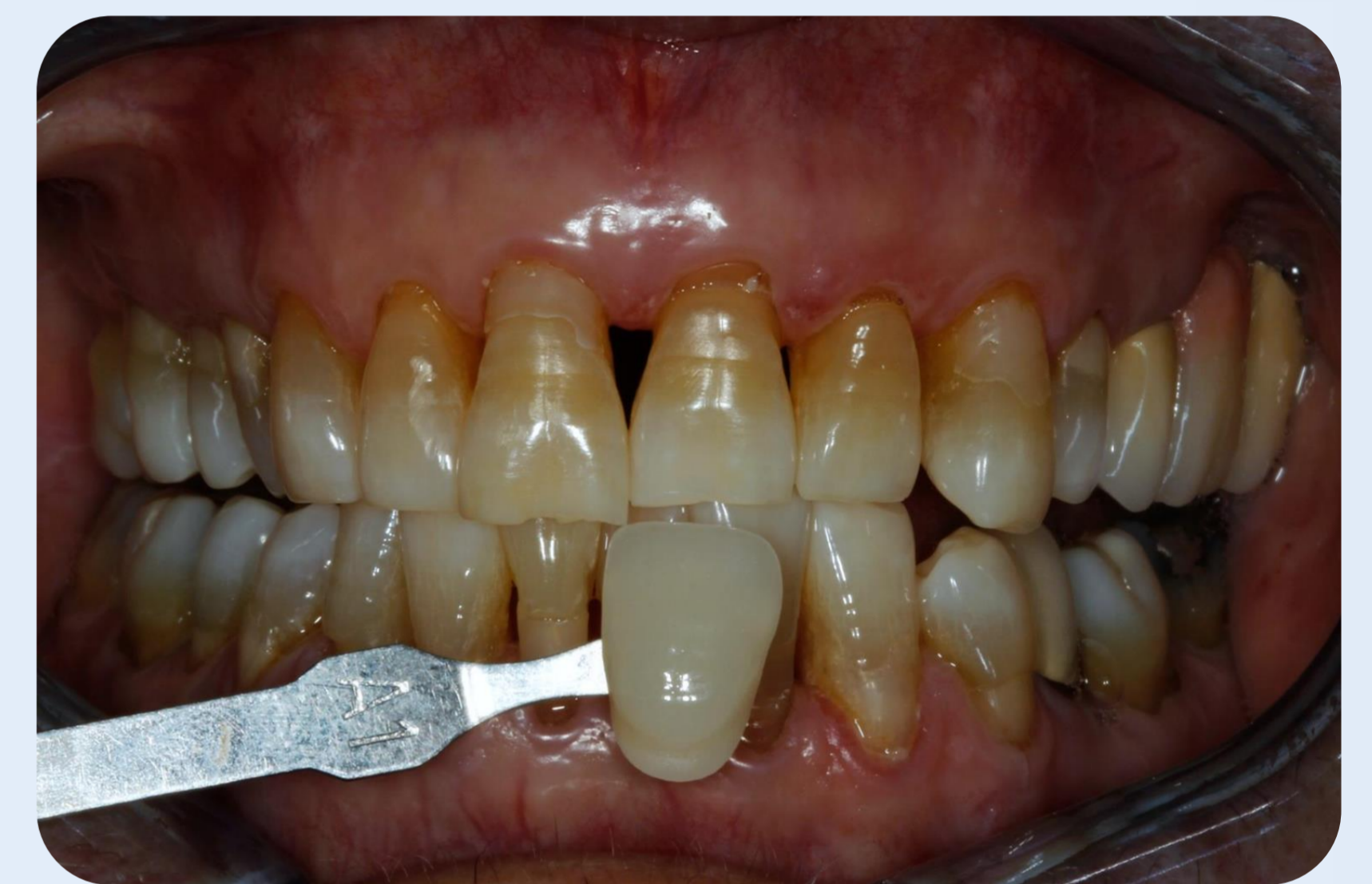
3. Final color of the incisal part A1