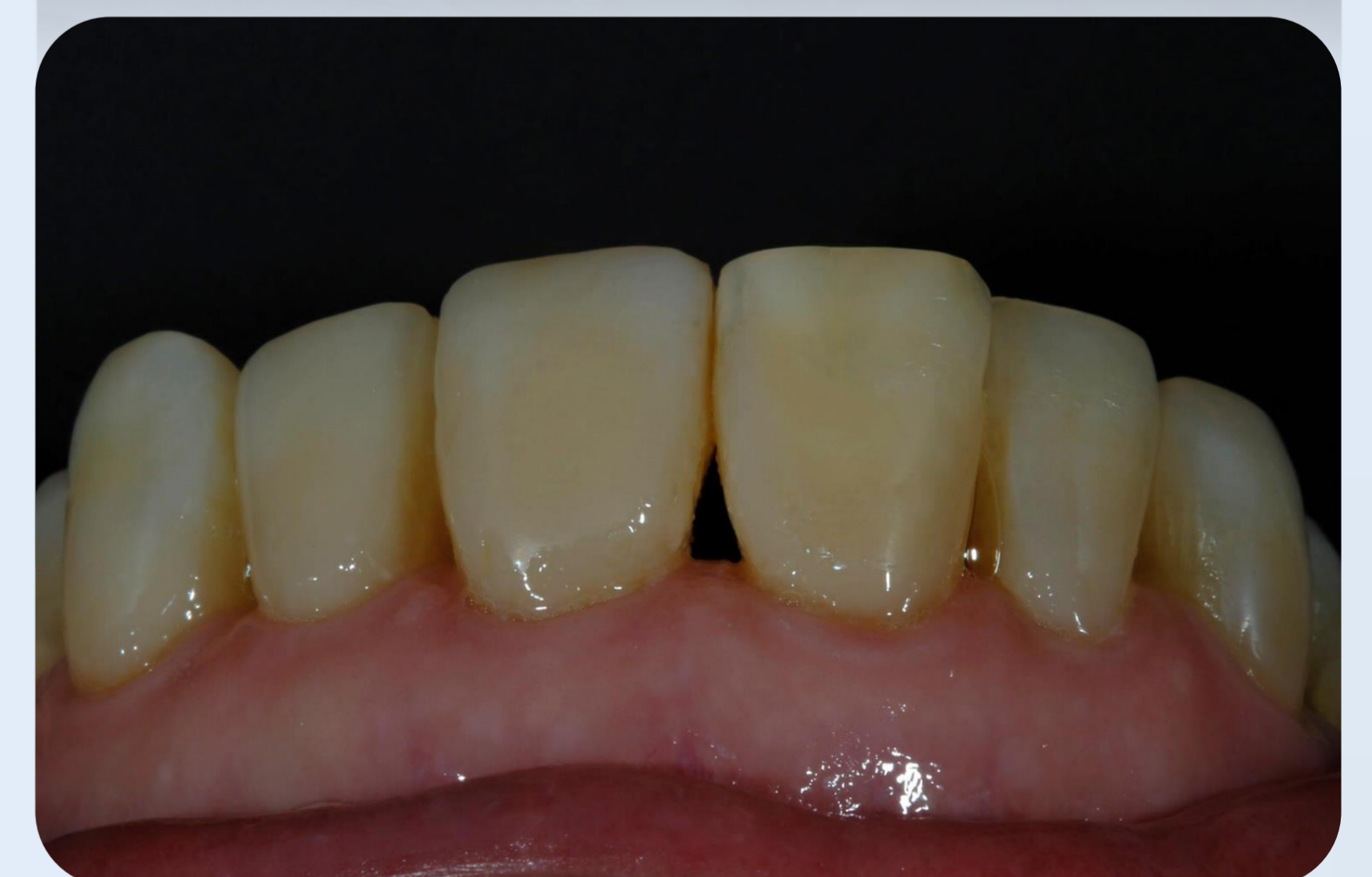
6. From different angle