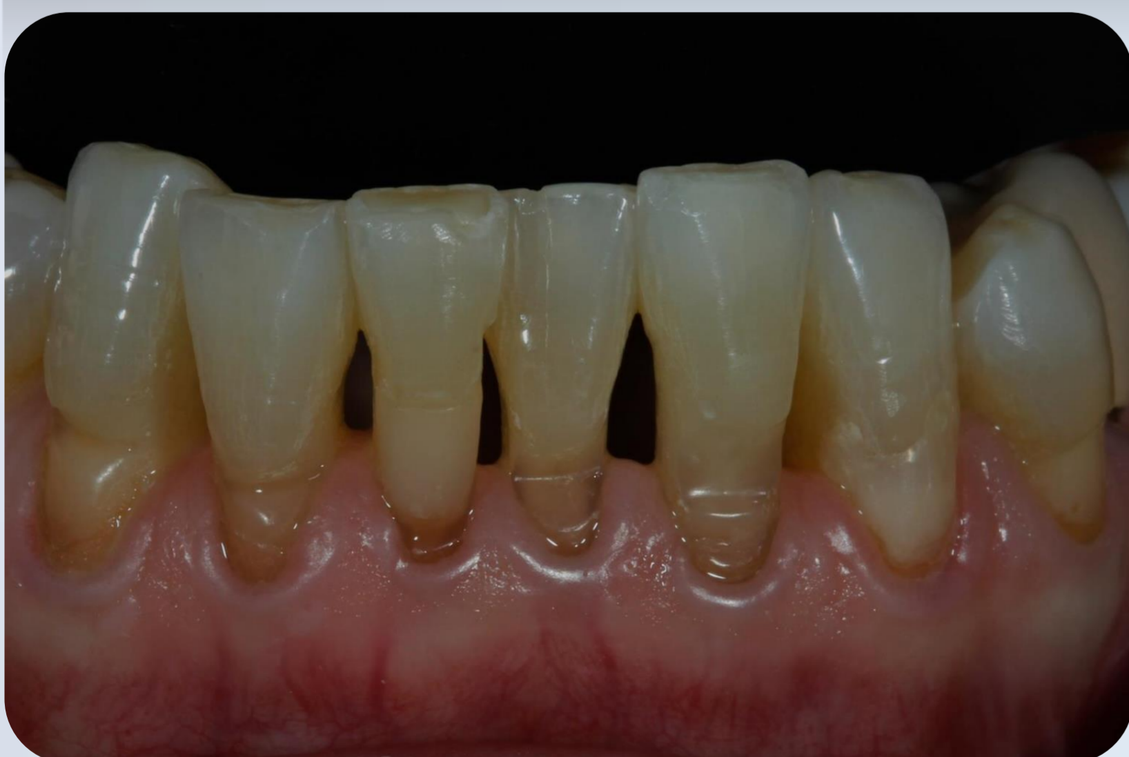
7. Lower 6 front teeth