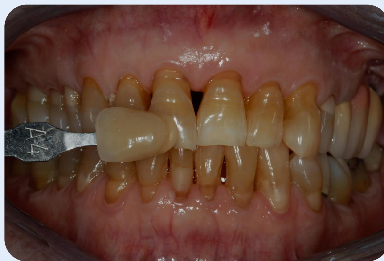
2. Initial color A4