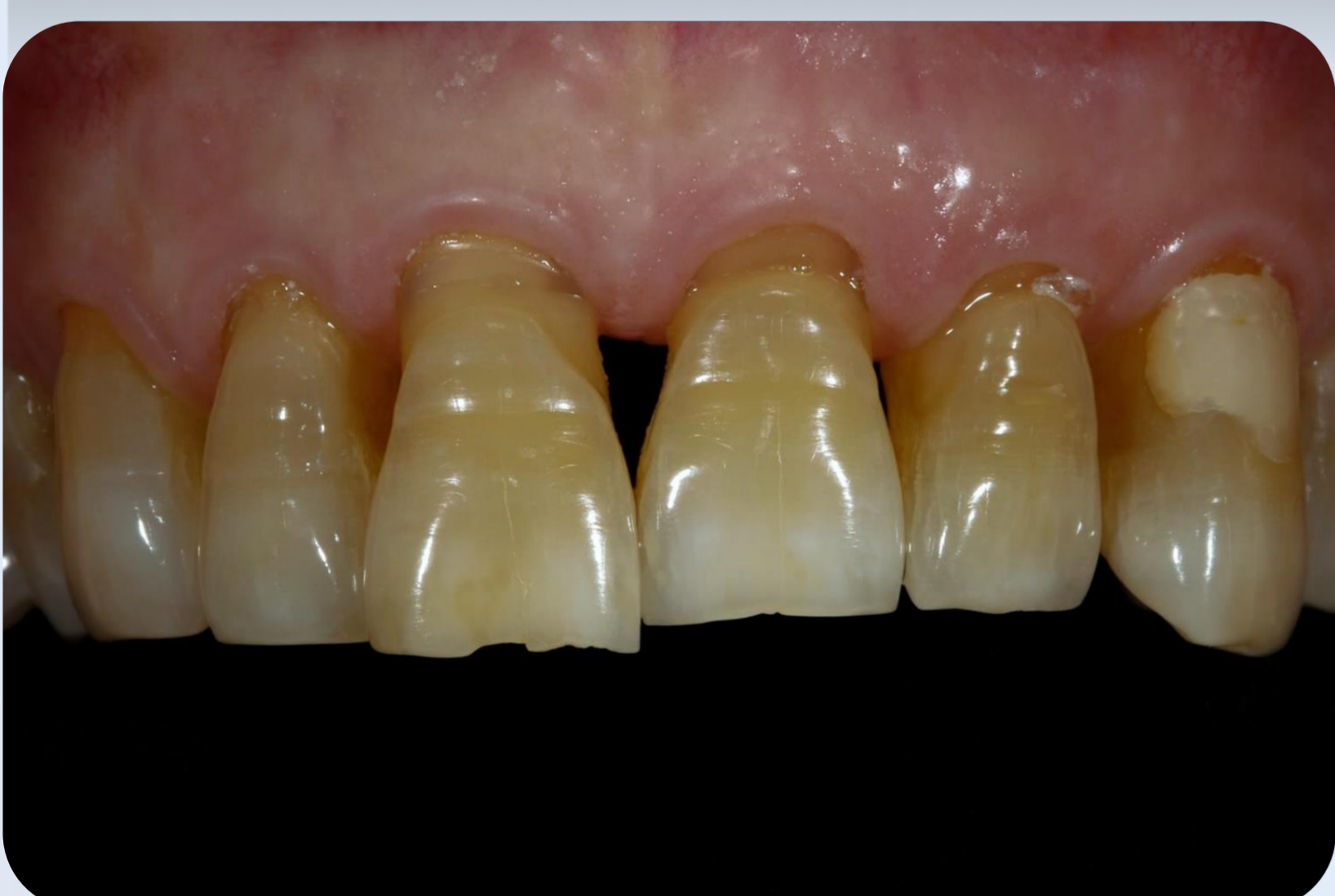
4. Upper 6 front teeth